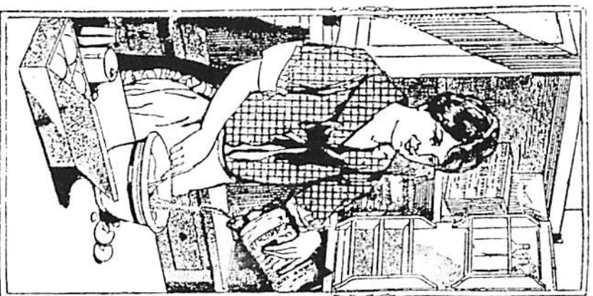
Baking for Passover with matzah meal. HatDear Hebrew Weekly, New York, 1932