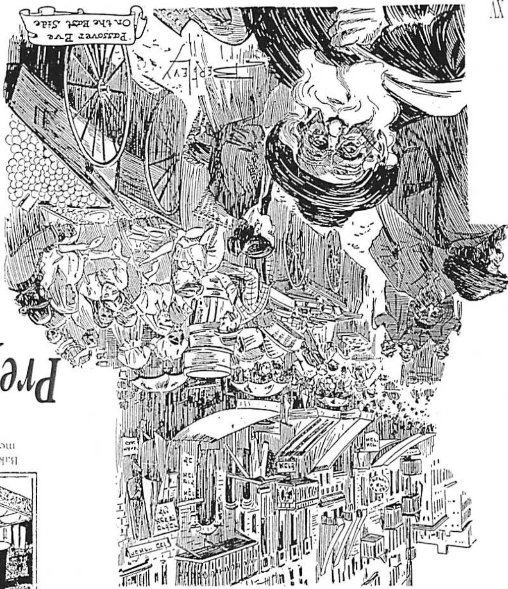
New York, April, 1905