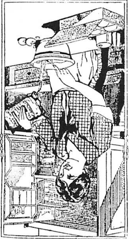
Baking for Passover with marzah meal, Hadoar Hebrew Weekly, New York, 1932