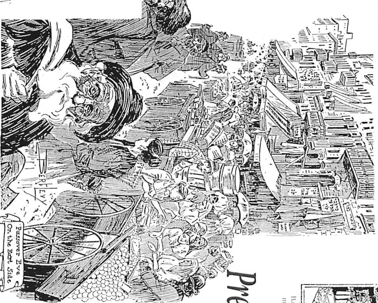
Passover Eve On the East Side