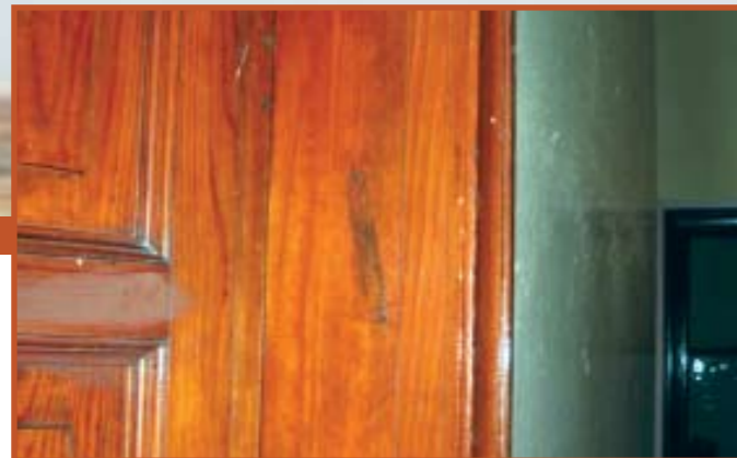
The doorpost is a witness to once-thriving Jewish life