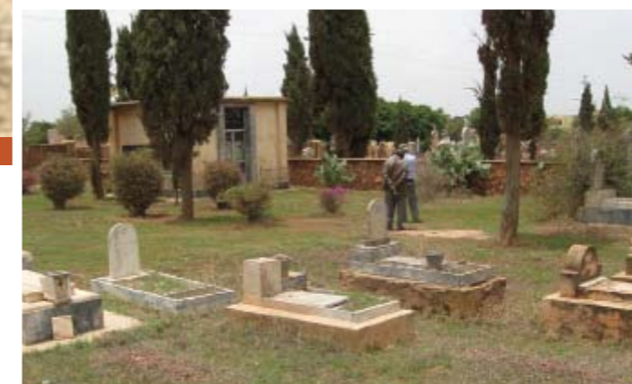
Despite a land feud, the cemetery has remained under Jewish protection

By the end of the nineteenth century, the Jews of Aden were a cosmopolitan, educated group, much more sophisticated than their simpler northern Yemenite Jewish brethren. Jews from Iraq, India, and even Europe joined the existing community. A number