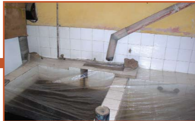
After years of disuse, the mikveh still functions