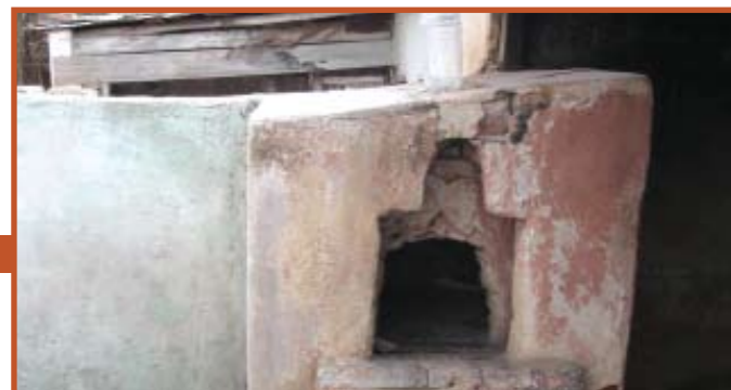
Matzah oven in the Cohen courtyard: today it all comes from Israel

A short walk around the center of town reveals the Italian flavor of the city and the ghosts of the Jewish community. The wealthy Adenite businessman Banin built the main shul, which celebrated its one-hundredth birthday in 2005. The synagogue is a beautiful building with a typical Sephardic sanctuary and a small balcony for the women's gallery. The aron kodesh still holds two sifrei Torah in their traditional Sephardic wooden cases, which are occasionally used. For example, a minyan happened to be present on Shabbos Zachor two years ago, and read from both Torahs. In many North African shuls, tzedakah boxes are built into the side of the bimah , designated for various communal needs. Asmara is no exception, and the various slots are still labeled: the poor of Asmara, the poor of Jerusalem, Rabbi Meir Baal HaNes, and, so as not to forget the folks back in the alter heim , "the poor of Aden."