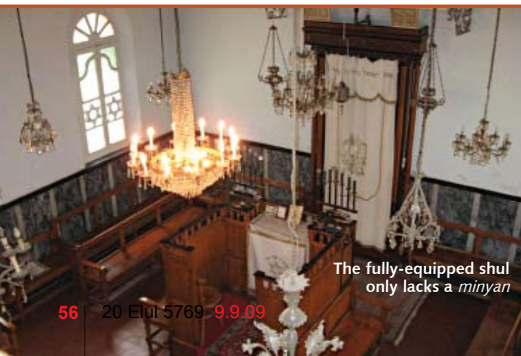
The fully-equipped shul only lacks a minyan