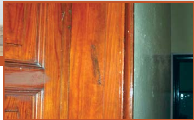
The doorpost is a witness to once-thriving Jewish life