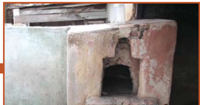
Matzoh oven in the Cohen courtyard: Today it all comes from Israel

building with a typical Sephardic sanctuary and a small balcony for the women's gallery. The aron kodesh still holds two sifrei Torah in their traditionally Sephardic wooden cases, which are occasionally used. For example, a minyan happened to be present on Shabbos Zachor two years ago, and read from both Torahs. In many North African shuls, tzedakah boxes are built into the side of the bimah , designated for various communal needs. Asmara is no exception, and the various slots are still labeled: the poor of Asmara, the poor of Jerusalem, Rabbi Meir Baal HaNes, and, so as not to forget the folks back in the alter heim , "the poor of Aden."