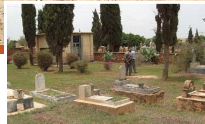
Despite a land feud, the cemetery has remained under Jewish protection